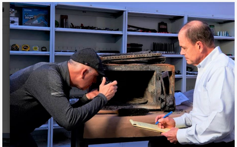
Each piece of evidence is examined in accordance with its distinctive characteristics

Because different pieces of evidence have different storage needs, the team ensures that each piece of evidence is stored appropriately taking care to appraise each piece of evidence in accordance with its distinctive characteristics. If there are unique situations, such as protection from temperature changes or other ambient conditions, National Forensic Consultant's (NFC's) team will take the necessary precautions to ensure this evidence is stored correctly.