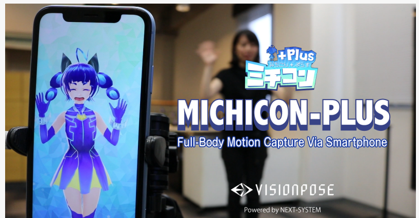
Full-Body Motion Capture App “MICHICON-Plus”

FUKUOKA CITY, FUKUOKA PREFECTURE, JAPAN, January 7, 2022 /EINPresswire.com/ -- NEXT-SYSTEM implemented their independently developed AI pose estimation engine “VisionPose” into their App “MICHICON-Plus”, to demonstrate how the AI engine can be utilized in smartphone and tablet applications.