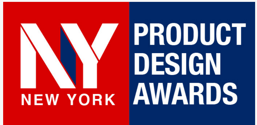
NY Product Design Awards Logo

The competition is open to participation by a global audience, and encourages product designers