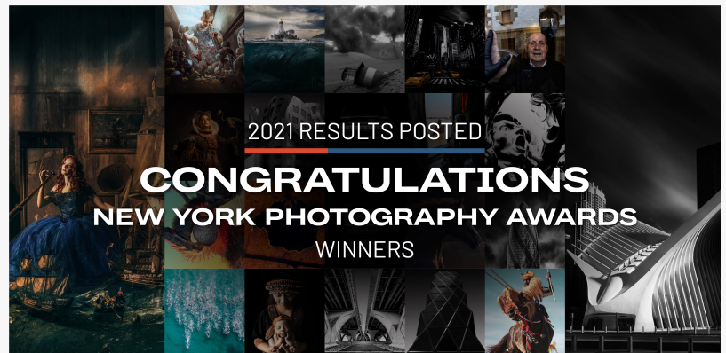
New York Photography Awards Winners Announced

With the multitudinous entries, New York Photography Awards has ranked them, via blind judging, in accordance to the industry's best standards, based on the creative messages and