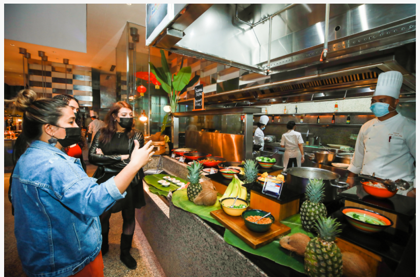
Restaurant guests at the Filipino buffet station at Anise Restaurant