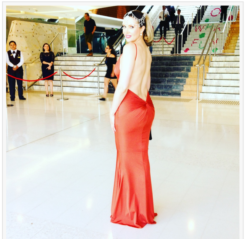
AACTA Awards Red Carpet