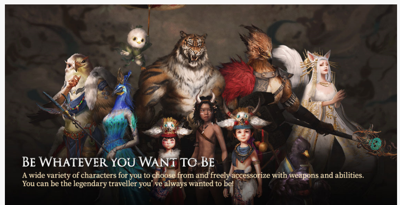
Image_ Be Whatever You Want to Be