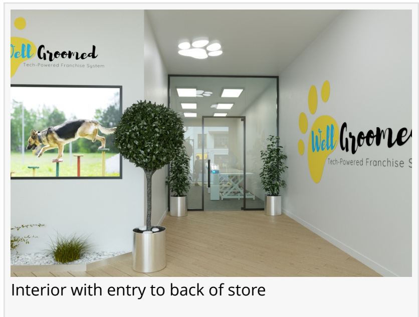
Interior with entry to back of store

Created by a team of respected and experienced business and industry leaders, entrepreneurs, veterinarians, franchise experts and elite groomers, Well Groomed Pets is a brand that deeply appreciates the commitment, passion and artistry groomers bring to this important industry, with a franchise system that has been designed to enable multi-store ownership through the use of proprietary operational and marketing technology. By combining deep knowledge of animal health with high-tech tools (like artificial intelligence, machine learning and mobile apps), Well Groomed Pets is designed to provide the most advanced, state-of-the-art wellness and grooming services available in the market today.