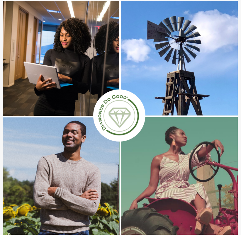
Diamonds Do Good® Entrepreneurship Grant - Launch image

This press release can be viewed online at: https://www.einpresswire.com/article/558615804 EIN Presswire's priority is source transparency. We do not allow opaque clients, and our editors try to be careful about weeding out false and misleading content. As a user, if you see something we have missed, please do bring it to our attention. Your help is welcome. EIN Presswire, Everyone's Internet News Presswire™, tries to define some of the boundaries that are reasonable in today's world. Please see our Editorial Guidelines for more information. © 1995-2021 IPD Group, Inc. All Right Reserved.