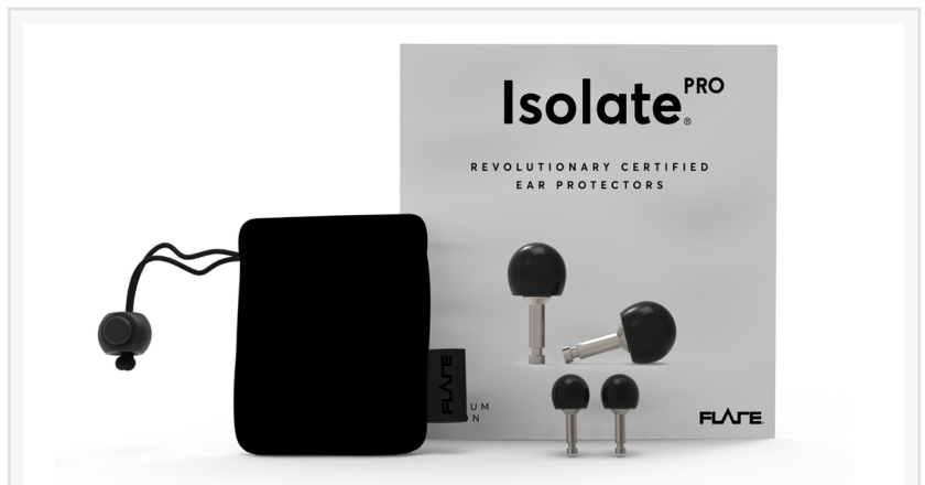
New Isolate Pro