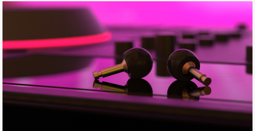
Great for protecting your hearing in loud environments