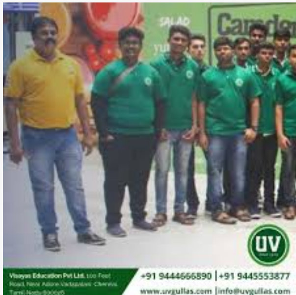
Gullas College of Medicine Campus Staff