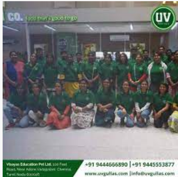
Gullas College of Medicine Student reviews

Philippines attracts students from more than 65 countries. Students come from the United States and Europe, Singapore, Malaysia, Taiwan, Thailand and Hong Kong and especially India.