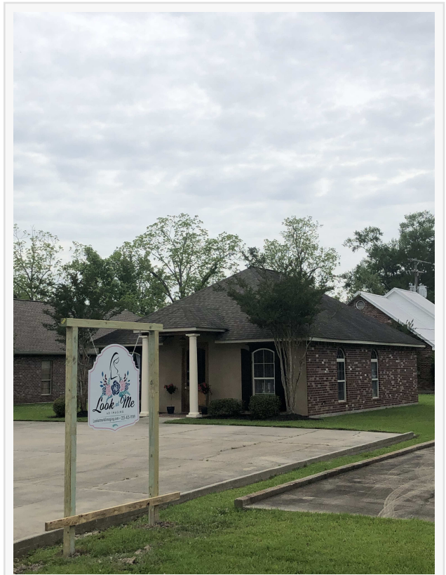
Look at Me 4D Imaging is a new Ultrasound Business in Livingston Parish, Louisiana

This press release can be viewed online at: https://www.einpresswire.com/article/558660702