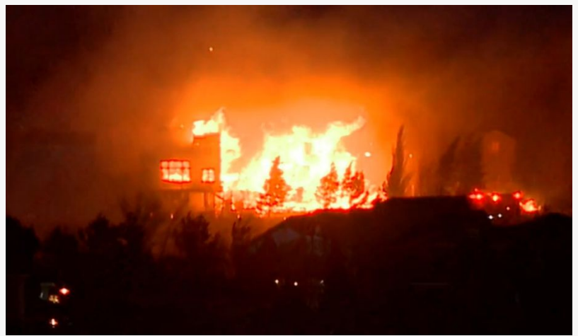
Colorado December 30