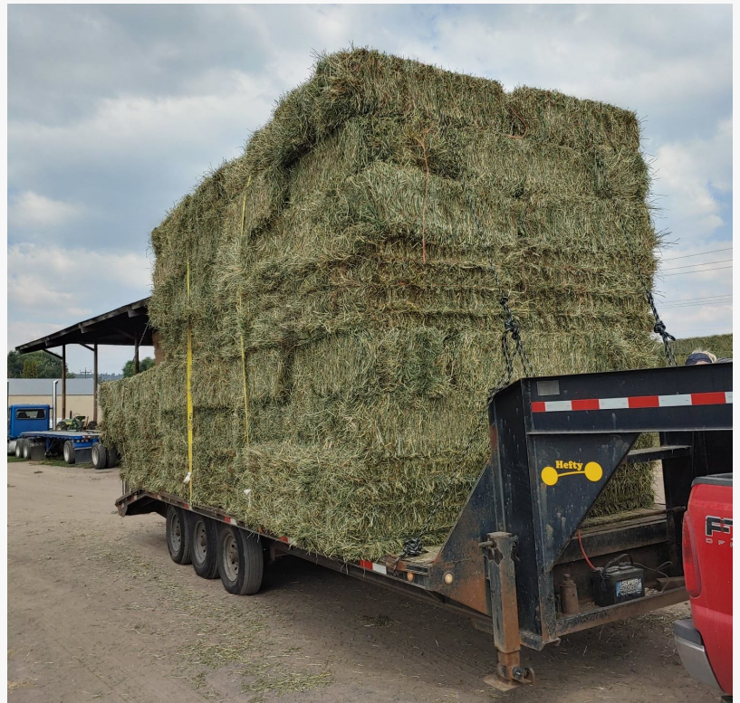
Oregon Hay Delivery