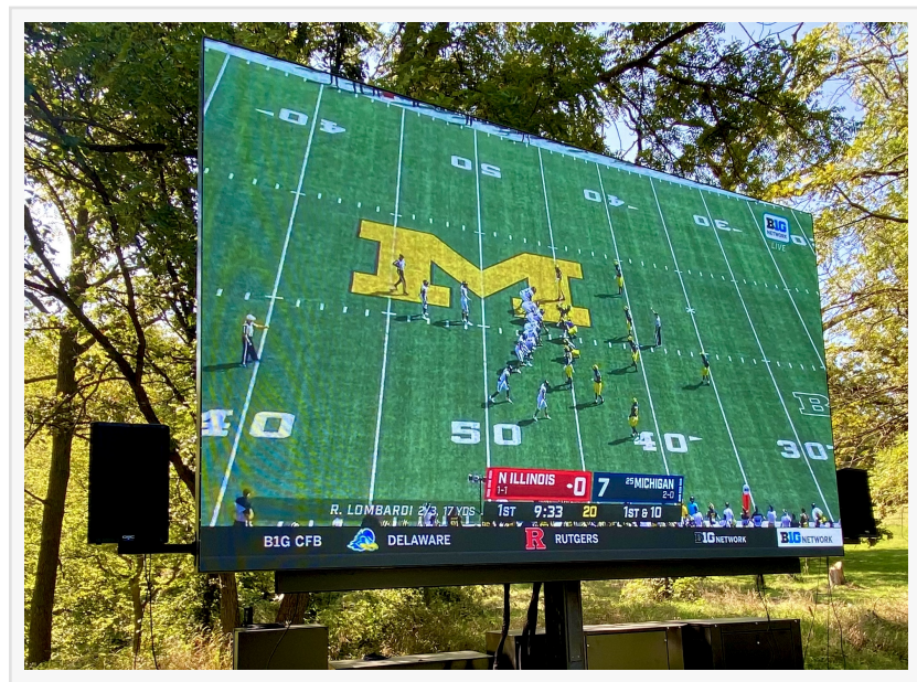
Michigan Football on Mobile LED Screen Tailgating Event

Additional services that are regularly requested by Mobile LED Screens rental customers include, still and motion live cameras with operator,