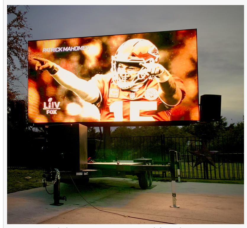
17-Foot Mobile LED Screen Rental for Client Super Bowl Event in Texas

wired/wireless microphones, custom PA and Line Array audio systems, run of show scripting and on-site show management, full or partial production assistance, and much more.