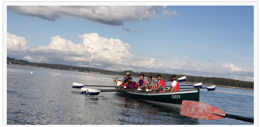
UPG Sustainability Leaders completing an activity on water together

About United People Global: UPG is a community that encourages and enables people to make the world a better place. UPG believes that all people have the power and the responsibility to participate in making the world a better place. The work of this global community is facilitated by United People Global Foundation, an independent not-for-profit organisation based in Geneva, Switzerland. UPG is not a political or religious organisation.