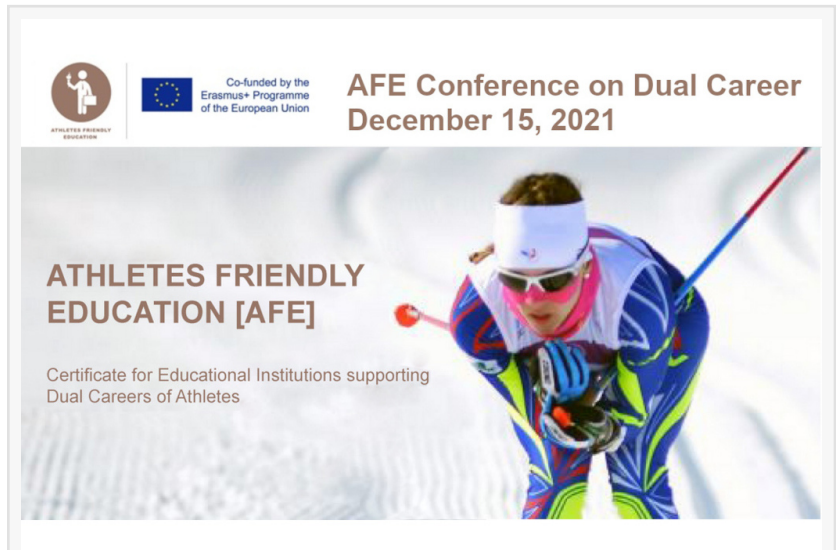
AFE Conference graphics

Speakers in the conference were the representatives of all the partners in the Erasmus+ project, and the event was attended by the interested public from all over Europe, including representatives of several national Olympic committees, universities and educational institutions, university sport bodies and others.