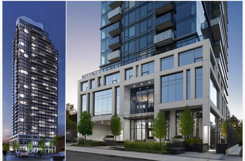
18 Erskine Exterior Rendering

TORONTO, ONTARIO, CANADA, December 21, 2021 / EINPresswire.com/ -- 18 Erskine's esteemed standing as a premium rental residence paired with KG Group's excellent customer service - has been recognized with two of FRPO MAC's most prestigious awards: Rental Development of the Year and Customer Service Award of Excellence.