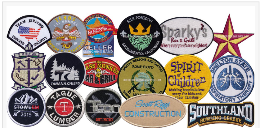
Custom Embroidered Patches

https://houstonembroideryservice.com/custom-iron-on-patches/