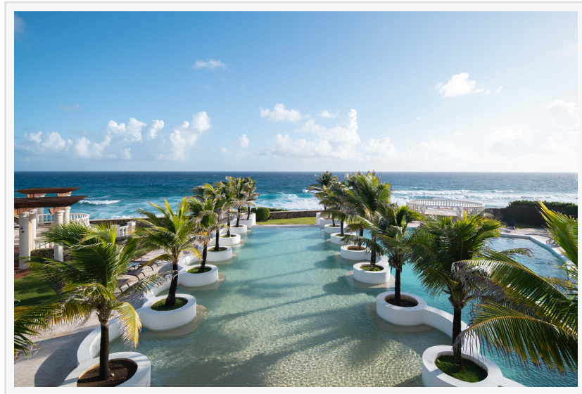
Resort-style pool surrounded in palm trees with ocean views

Concierge Auctions is the world's largest luxury real estate auction marketplace, with a state-of-the-art digital marketing, property preview, and bidding platform. The firm matches sellers of one-of-a-kind homes with some of the most capable property connoisseurs on the planet. Sellers gain unmatched reach, speed, and certainty. Buyers receive curated opportunities. Agents earn their commission in 30 days. In November 2021, Concierge Auctions was acquired by Sotheby's, the world's premier destination for fine art and luxury goods, and Realogy Holdings Corp., the largest full-service residential real estate services company in the United States, holding a joint 80 percent ownership stake. Concierge Auctions continues to operate independently, partnering with real estate agents affiliated with many of the industry's leading brokerages to host luxury auctions for clients. Since Concierge Auctions' inception in 2008, it has generated billions of dollars in sales, broken world records for the highestpriced homes ever sold at auction and conducted auctions in 46 U.S. states and 30 countries. The firm owns one of