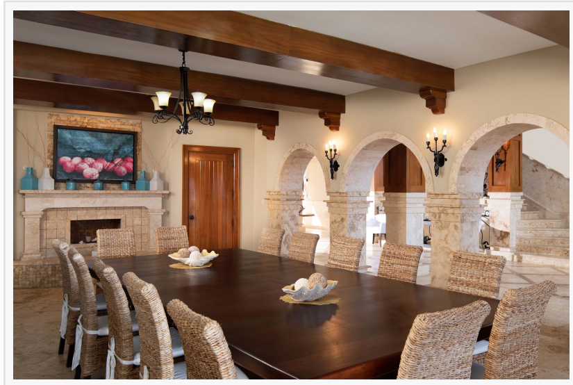
Indoor and outdoor entertaining spaces

Nestled between Río San Juan and Nagua, Cabrera is considered one of the most beautiful places in the entire Dominican Republic. The Atlantic stretches out beyond this north coast paradise and boasts incredible beaches to enjoy. Playa Grande, declared one of the most beautiful beaches in the world by Condé Nast Traveler, is mere minutes away. Cabrera is well-established as an ideal location for luxury vacation and short-term rentals, with countless famous