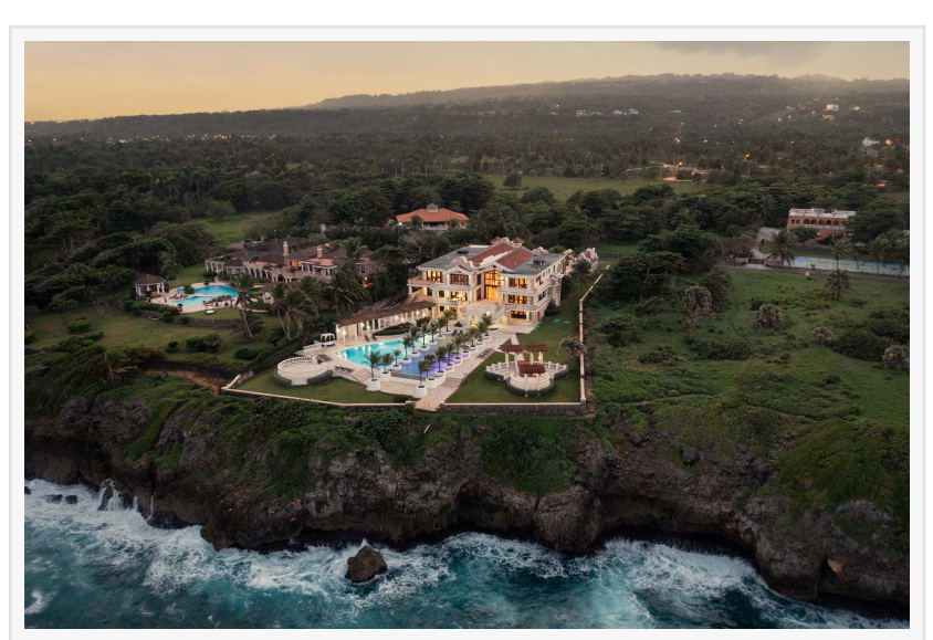
Ultra-luxury 16,500sf Spanish Colonial villa on the Atlantic