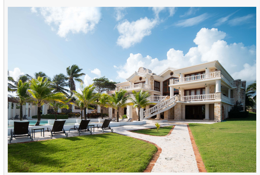
Wander down a 60ft cliffside to a secluded whitesand beach

the most comprehensive and intelligent databases of high-net-worth real estate buyers and sellers in the industry, and it has committed to build more than 300 homes through its Key For Key<sup>®</sup> giving program in partnership with Giveback Homes<sup>™</sup>, which guarantees that for every property the company sells, a new home is funded for a family in need. For more information, visit ConciergeAuctions.com.