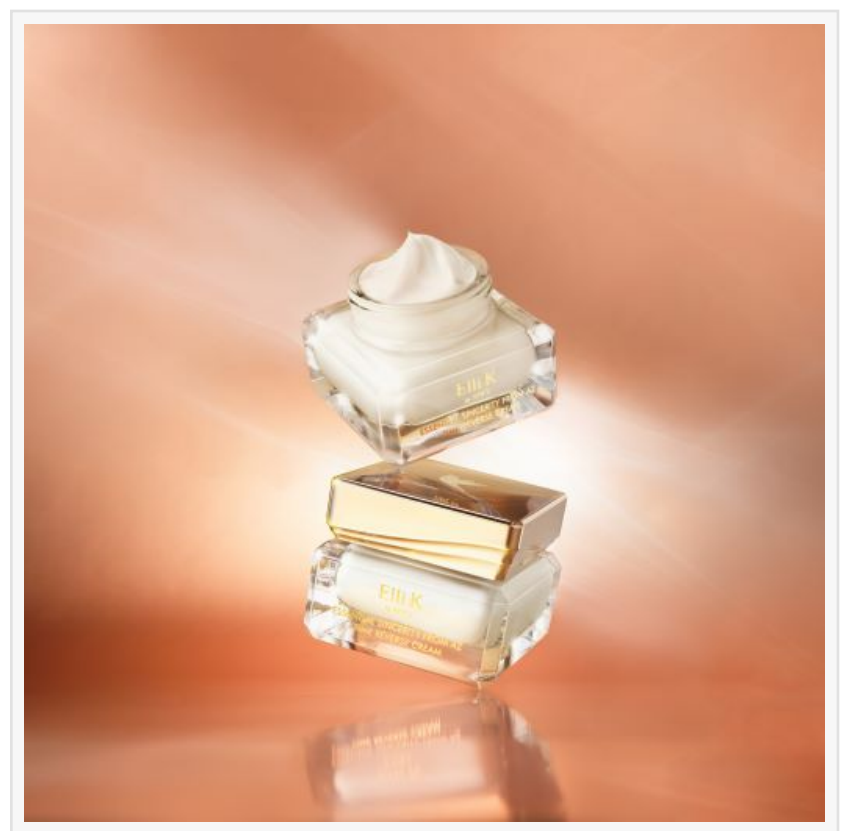
Essential Sincerity from AZ - Time Reverse Cream

In addition to touch and sound, the luxurious fragrance of the Elli K skincare products reinvigorate the sense of smell. Created by experts based on over a century of research in Argeville, France, the natural fragrances within the products enhance the relaxation and restoration of balance in the body.