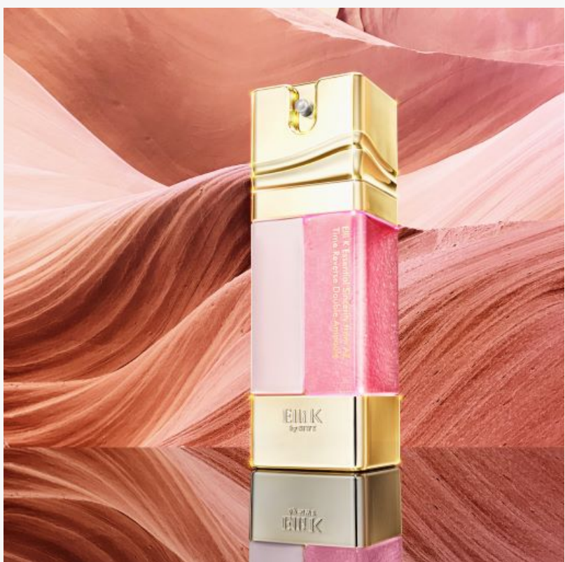
Essential Sincerity from AZ - Time Reverse Double Ampoule