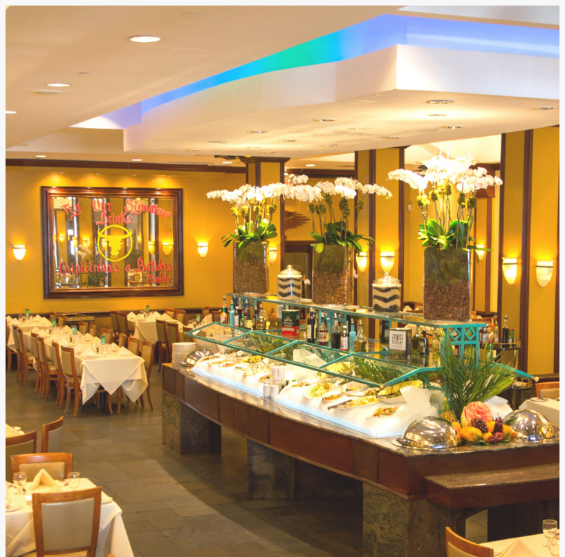
Churrascaria Plataforma Dining Room

/EINPresswire.com/ -- Churrascaria Plataforma is an authentic Brazilian "Churrascaria," a restaurant that serves mostly grilled meat, that is taking New York City by storm. The Rodizio style restaurant uses the method of serving various cuts of meat that originated in the southern part of Brazil in the early 1800s. The idea is to serve a wide variety of different cuts of meat, such as beef, pork, lamb, chicken, and so on, to each diner individually at their table, so there is no traditional menu as it consist of an all-you-can-eat menu and continuous table-side service.