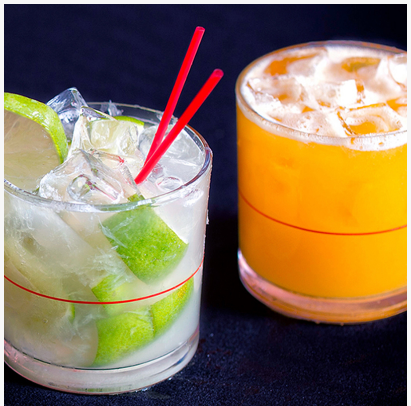
Churrascaria Plataforma Caipirinha cocktails