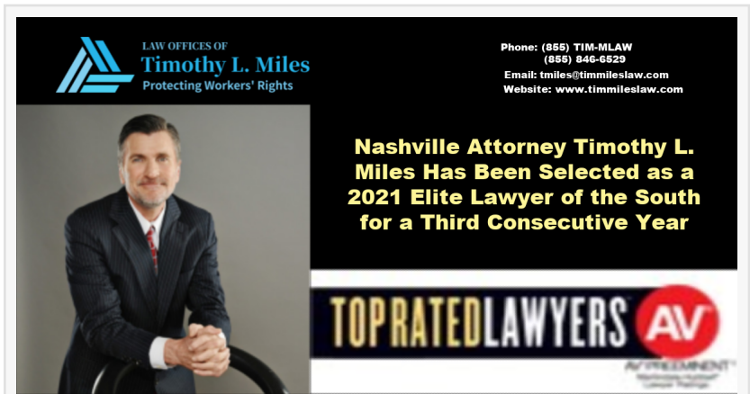
A Nationally Recognized Shareholder Rights Attorney

On July 20, 2021, Sleep Number announced its financial results for its second fiscal quarter ended June 30, 2021, revealing it had missed consensus estimates on the top and bottom line for the quarter and