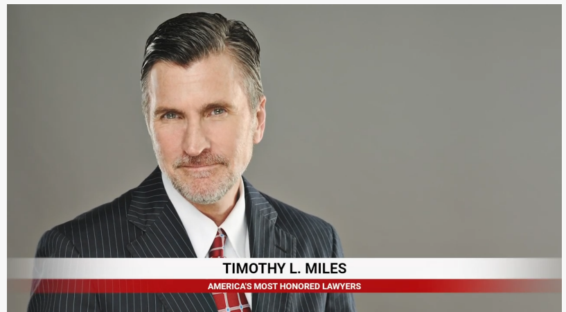
A Nationally Recognized Shareholder Rights Attorney