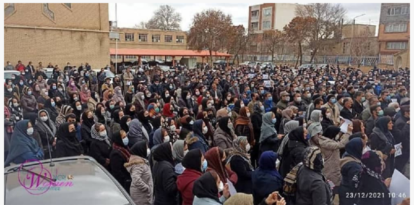
Sanandaj, Iran, December 23, 2021 - Teachers stage gathering to protest their meager wages, dire living conditions

PARIS, FRANCE, December 24, 2021 /EINPresswire.com/ -- The National Council of Resistance of Iran (NCRI) and the People's Mojahedin Organization of Iran (PMOI / MEK Iran) , reported that Iranian teachers' rights have been systematically violated during the 42 years of the mullahs' rule, and their demands have not been considered in next year's budget.