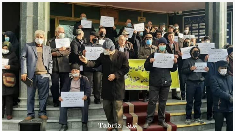
Tabriz, Iran, December 23, 2021 - Teachers stage gathering to protest their meager wages, dire living conditions