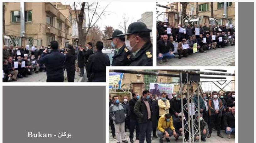
Bukan- Iran, December 23, 2021 - Teachers stage gathering to protest their meager wages, dire living conditions.

Iranians have not forgotten that two years ago, on the day Qassem Soleimani was killed, Khamenei paid 200 million euros (nearly 50 trillion rials) to his mercenaries in the terrorist