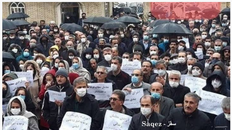
Saez, Iran, December 23, 2021 - Teachers stage gathering to protest their meager wages, dire living conditions

Iranian media recently reported: "According to the teacher ranking bill passed by the parliament's education commission, teachers' salaries should reach at least 80% of university faculty members, but Iranian officials say there is not enough funding to implement such a bill."