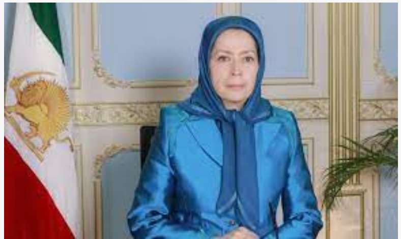
NCRI President-elect Maryam: With their courageous protests today, teachers showed that they will not back down despite the regime's threats, deceptive and suppressive measures.