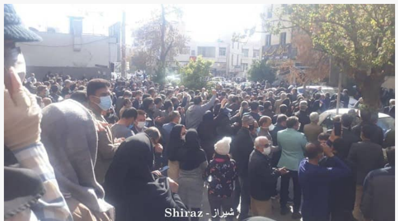
Shiraz- Iran, December 23, 2021 - Teachers stage gathering to protest their meager wages, dire living conditions.