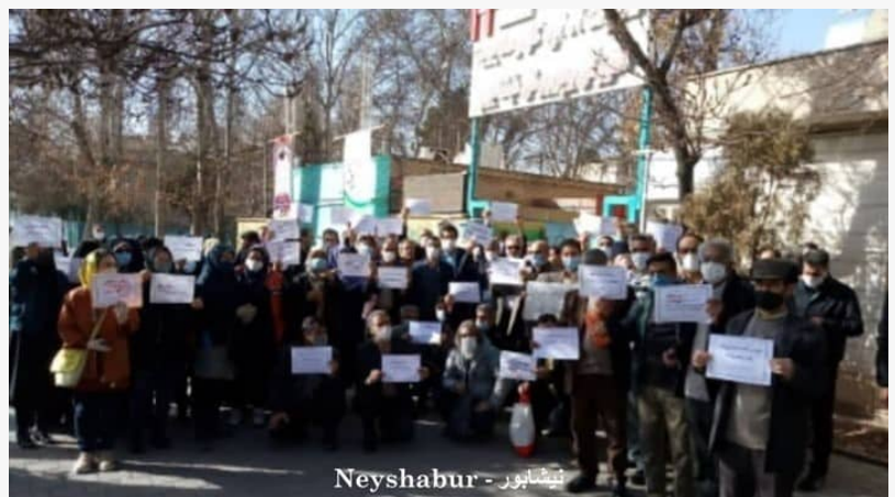
Neyshabur- Iran, December 23, 2021 - Teachers stage gathering to protest their meager wages, dire living conditions.