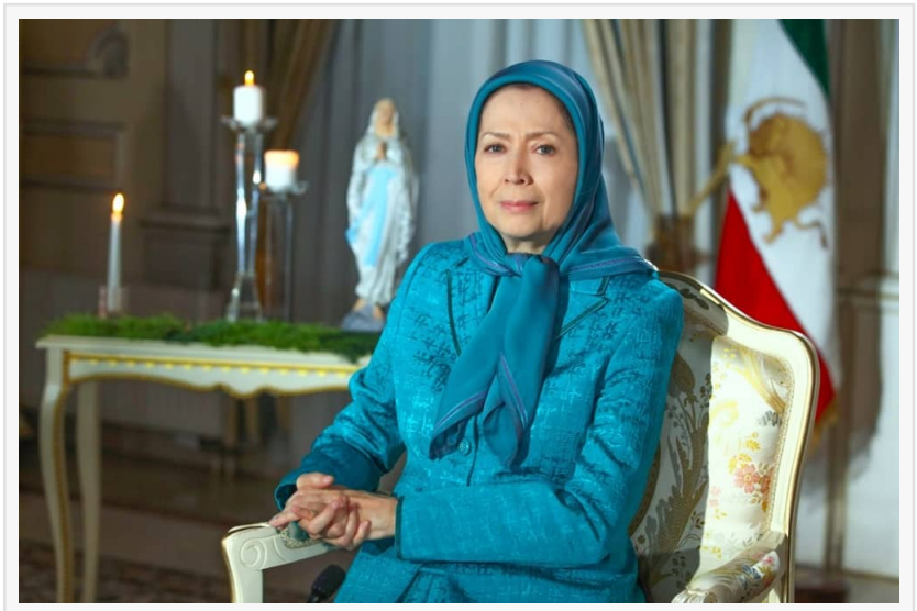
Greetings to Jesus Christ the "Sun of Justice" for the deprived & oppressed and the guiding star encouraging them to rise and revolt for freedom.

The Holy Quran describes her as one of the greatest missionaries of unity and trailblazers of human liberty.