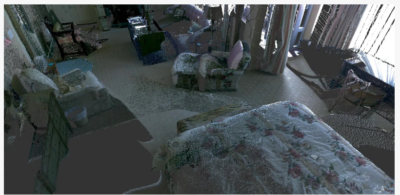
Laser Scanning for As-Built Project in Washington DC

Models of Mechanical, Electrical, Plumbing & Fire Protection services. Constructability reviews were conducted for RFI Generation & as-built updates. BIM engineers delivered shop drawings, facilitating complete coordination amongst engineers and MEP consultants. Detailed quantity takeoffs incorporating manufacturer's reference were also provided."