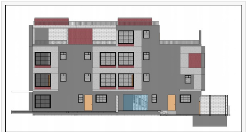
Revit BIM Architectural Model of Jhaveri Brother Bungalow