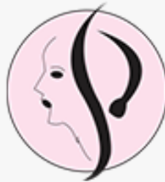
Profile Forte Logo