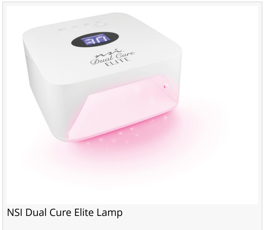
NSI Dual Cure Elite Lamp

This press release can be viewed online at: https://www.einpresswire.com/article/559280662