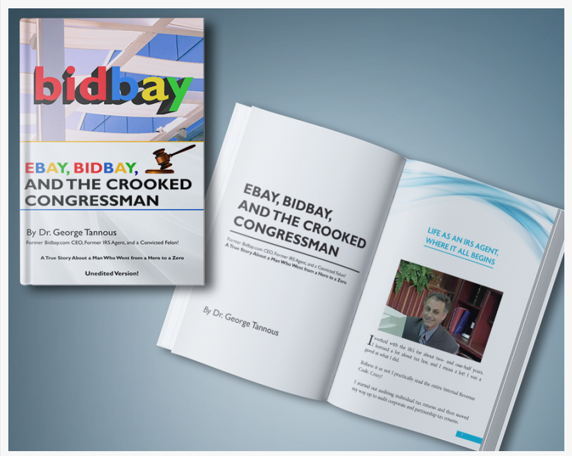
eBay, Bidbay, and the Crooked Congressman inside view