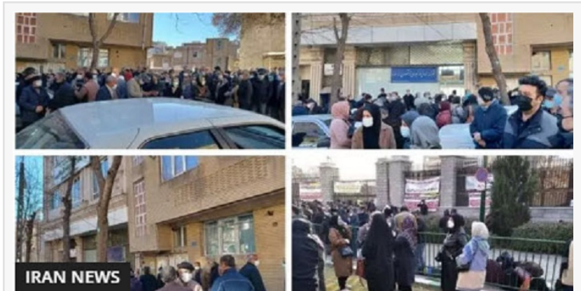
Retirees and pensioners of the Steel Fund held rallies in several cities across Iran on Sunday, protesting poor living conditions, low wages, and the regime's lack of response to their demands.

PARIS, FRANCE, December 28, 2021 /EINPresswire.com/ -- According to the activists of the people's Mojahedin Organization of Iran (PMOI / MEK ), retirees and pensioners of the Steel Fund held rallies in several cities across Iran on Sunday, protesting poor living conditions, low wages, and the regime's lack of response to their demands.