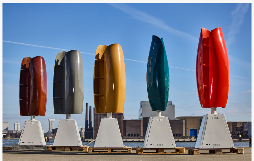
Bouquet of Wind Tulip Turbines

You should read the Offering Circular and risks related to this offering before investing. This Reg A+ offering is made available through StartEngine Primary, LLC member FINRA ( www.finra.org )/SIPC ( www.sipc.org ).