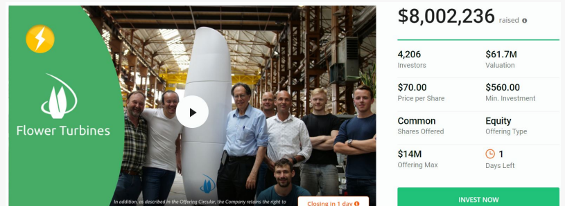
Flower Turbines Funding Site Reaching $8 million