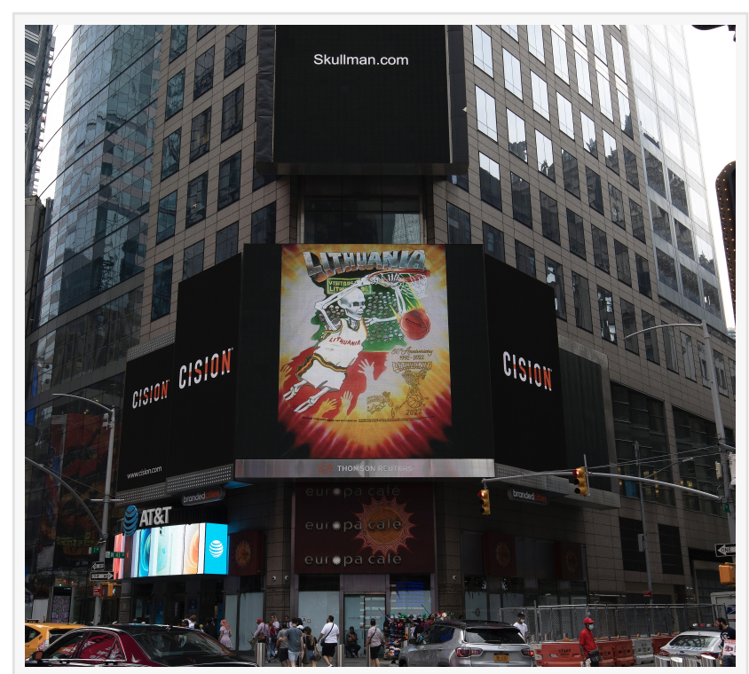
30th Anniversary Year Commemorative Lithuania Tie Dye® Slam Dunking Skeleton Jerseys unveiled in the center of the world Times Square, NYC

Skullman.com releases the 30th Anniversary Edition of the <u>Lithuania Tie</u> <u>Dye</u>® basketball uniform tees made famous during the 1992 Barcelona Summer Olympics, featuring the iconic Skullman ® trademark slam dunking a flaming basketball. The new release gives the public another chance to own