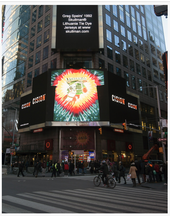
The Original 1992 Barcelona Lithuania Tie Dye® Skullman® Basketball Jerseys Tees in Times Square NYC

This press release can be viewed online at: https://www.einpresswire.com/article/559433162