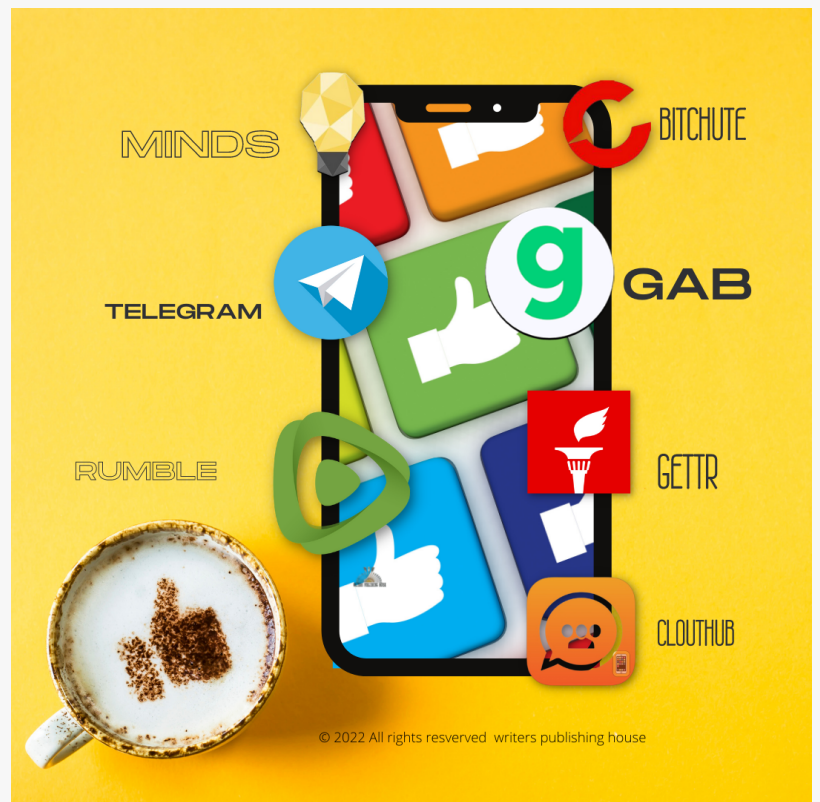
ICOMM Alternative Media Icon

Writer's Publishing House has developed an exceptional business marketing process.