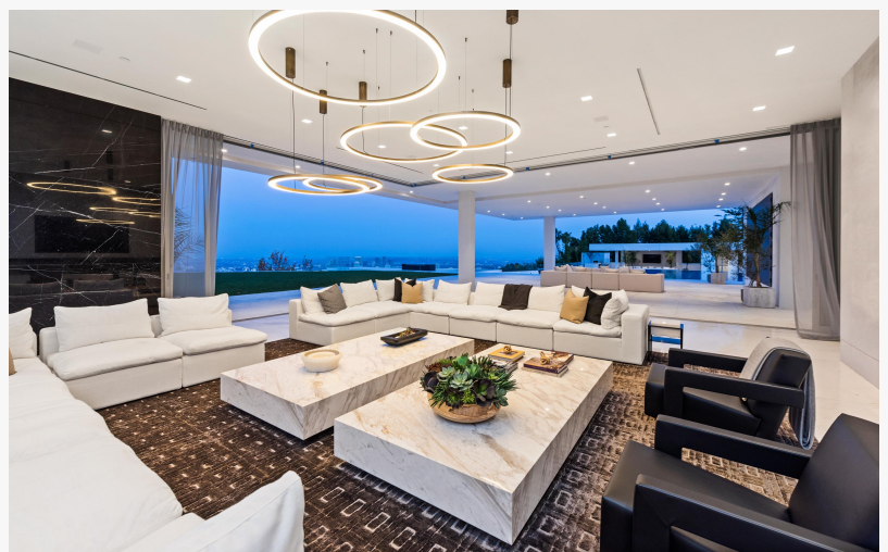
The first and last of its kind, The One is elevated to maximize its 360-degree panoramic views of the Pacific Ocean, downtown Los Angeles, and the San Gabriel Mountains.

A short-list of just some of the incredible additional features include numerous custom-curated artworks including a rotating custom statue in the grand foyer by Mike Fields, a butterfly installation by Stephen Wilson, and a custom sculpture from Italian glass artist Simone Cenedese; private two-story library/office with a balcony, custom-made LED and black hand-lacquered built-ins from Italy, and water features touching three windowed walls; VIP area in the exclusive nightclub; main pool with infinity edge on three sides and massive deck, spa, and covered entertaining space; spanning yard with thirty-foot-high palms; three-bedroom guest house with floor-to-ceiling windows, an Oto Murano chandelier by Vistosi, and parquet flooring; custom bar with smoked-mirror backsplash and marble countertops and cigar lounge; four-lane bowling alley; putting green; wellness center and gym with Technogym equipment and 64-foot indoor pool; juice bar; philanthropy pavilion; tennis