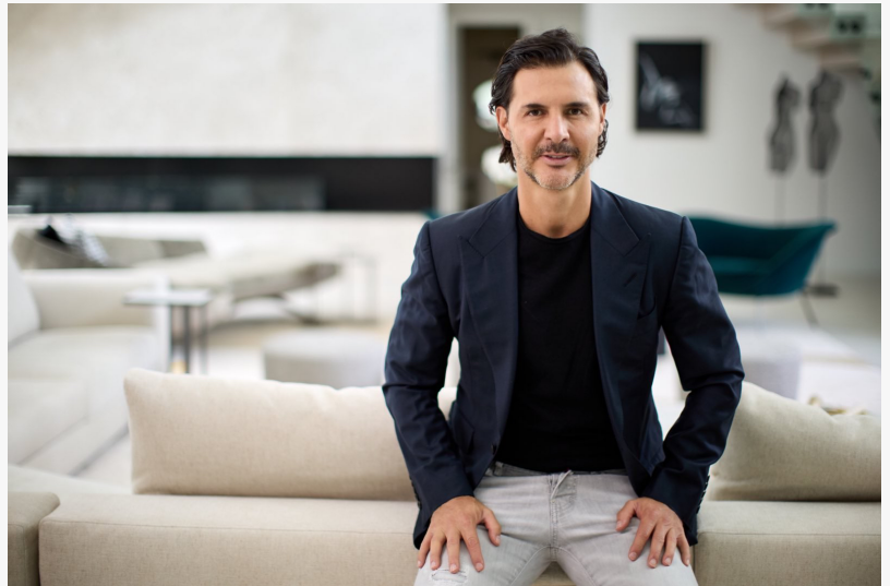
¿Quien es German Rosete?

This press release can be viewed online at: https://www.einpresswire.com/article/559445217