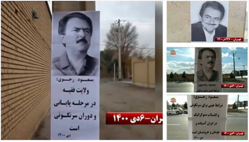
Tehran – Activities of the MEK supporters and the Resistance Units – "Massoud Rajavi: Velayat-e faqih regime is in its final stag of overthrow" – December 22, 2021

The activities of the Resistance Units and MEK supporters included posting banners, in various parts of Tehran and other cities, including Mashhad, Isfahan, Shiraz, Qazvin, Hamadan, Zanjan, and Yasuj.