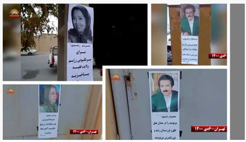
Tehran – Activities of the MEK supporters and the Resistance Units – "Maryam Rajavi: The Iranian people do not want to be under the yoke of the mullahs' rule" – December 27, 2021

In late December 2017 and in January 2018, massive protests erupted throughout the Islamic Republic of Iran. The largest countrywide uprising since 2009 started in the northeastern holy city of Mashhad, the secondlargest city in Iran, and a few towns on December 28, and spread to some 142 cities and towns in all 31 provinces at a shocking pace.