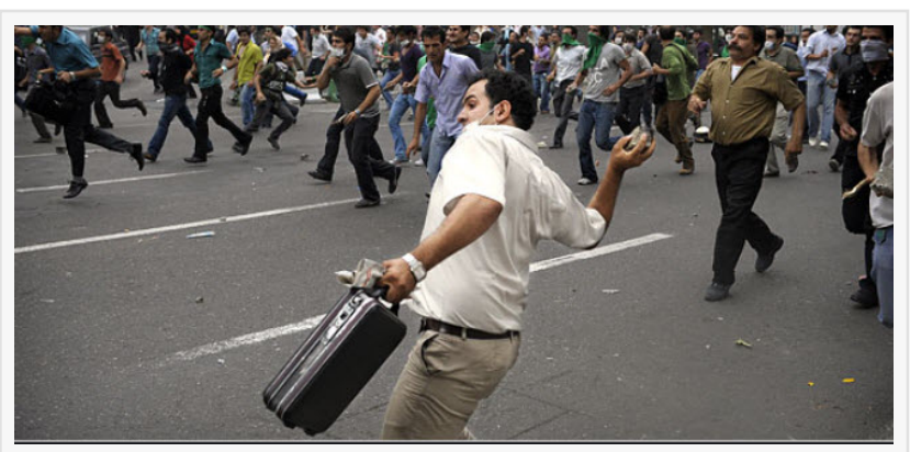
The opposition put the number of detainees at 8,000 but there are indications that this may be a somewhat conservative estimate. At least 14 protesters were killed in detention.