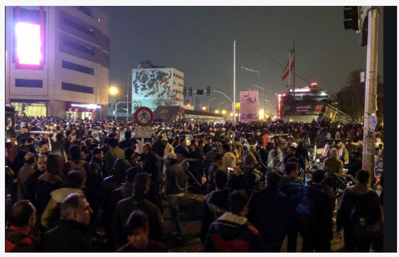
In late December 2017 and in January 2018, massive protests erupted throughout the Islamic Republic of Iran. The largest uprising since 2009 started in the northeastern holy city of Mashhad, the secondlargest city in Iran, on December 28.

"Maryam Rajavi (the President-elect of the National Council of Resistance of Iran (NCRI)): Rise up to overthrow the velayat-e faqih regime," "Maryam Rajavi: The Iranian people do not want to be under the yoke of the mullahs' rule,"