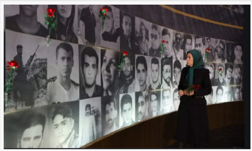
According to the National Council of Resistance of Iran, some 50 protesters were killed and a member of the mullahs' parliament cited the head of the Prisons Organization and said that they had registered 4,972 arrests.

This press release can be viewed online at: https://www.einpresswire.com/article/559450981