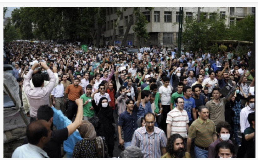
Resistance Units of MEK Underscored the religious dictatorship will be overthrown. Coinciding with the fourth anniversary of the Dec 2017 uprising in 140 cities in Iran, the Resistance Units and supporters (MEK/PMOI)marked the uprising.

The 2017 uprising, which began with large demonstrations by the people of