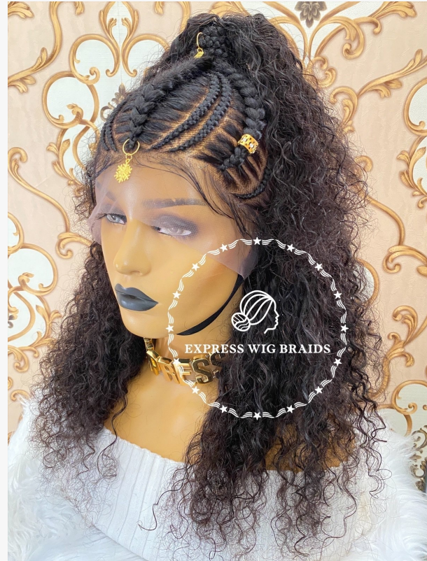
african american braid wigs

This effort will definitely continue for a very long time and no amount of obstacle like this Covid-