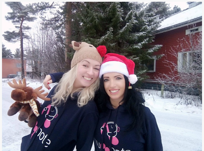
Huggnote founders are delighted with apps Holiday Huggs global reach