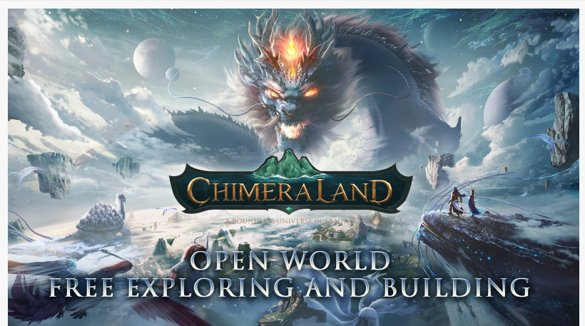
Open World Free Exploring and Building