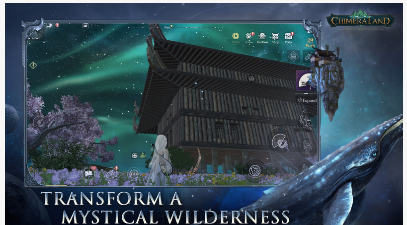
Transform A Mystical Wilderness