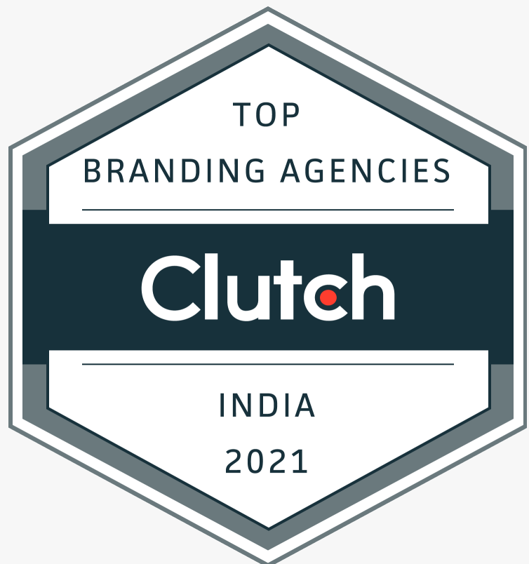
Top Branding Agency