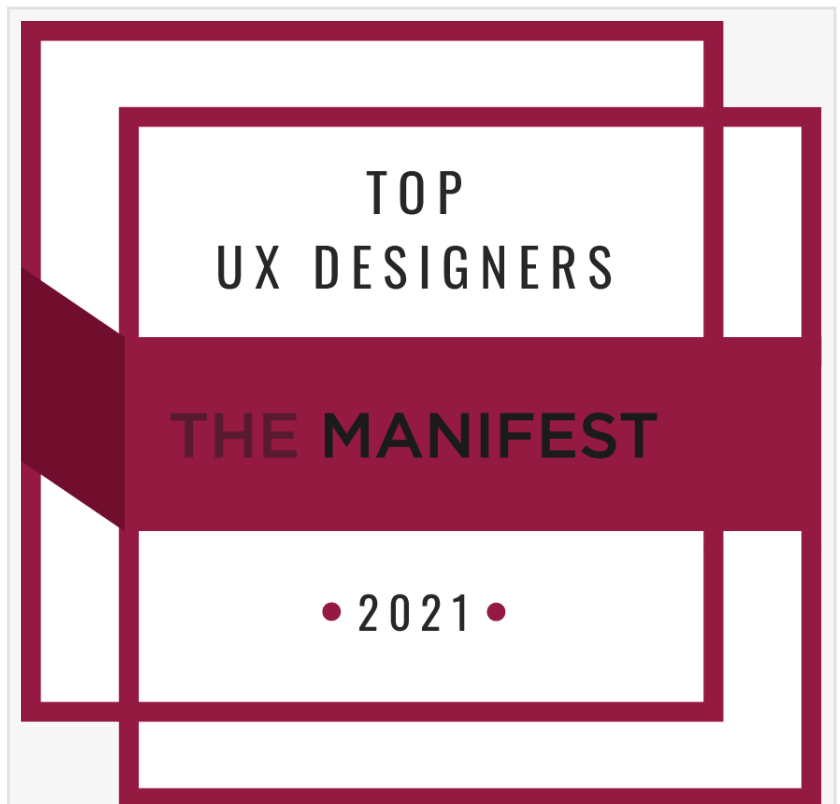
Top UX Designers

A B2B research, ratings, and reviews firm in the heart of Washington, D.C., Clutch connects small and medium businesses with the best-fit agencies, software, or consultants they need to tackle business challenges together and with confidence. Clutch's methodology compares business