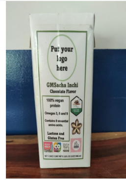
GMSacha Inchi Beverage