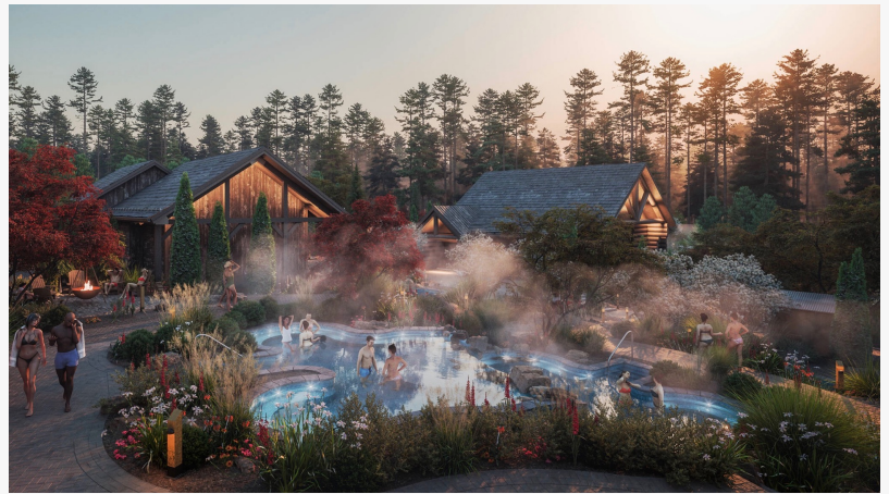
Thermëa spa village Whitby