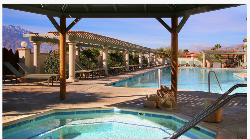
Azure Palm Hot Springs Resort

/EINPresswire.com/ -- While the fate of winter lockdown and 2022 travel plans remain unknown for the time being, the good news is that we can still dream . Spas of America, the largest spa and wellness travel website has