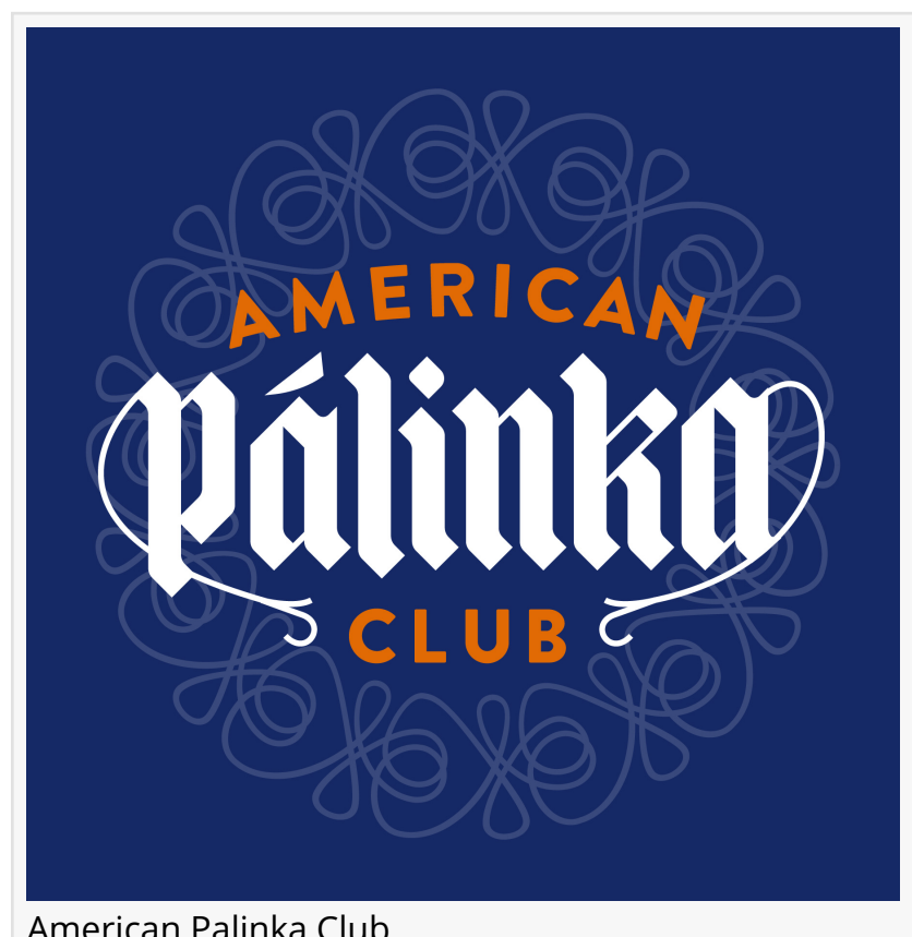
American Palinka Club

With the launch of American Pálinka Club in 2021, an online platform that sells proper Hungarian pálinka and aims to spread knowledge about the product, Americans can now enjoy this classic and popular spirit in their home. Dating back 700 years, pálinka is