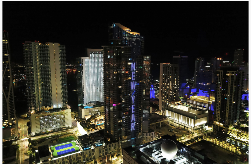
World's tallest electronic New Year's Countdown Clock; world's biggest animated Champagne Geyser; and world's largest Digital Fireworks display light-up South Florida skyline this holiday weekend, at the 60-story Paramount Miami Worldcenter skyscraper.

It all starts at sunset on New Year's Eve, December 31, 2021 through 11:59 p.m. on Monday,