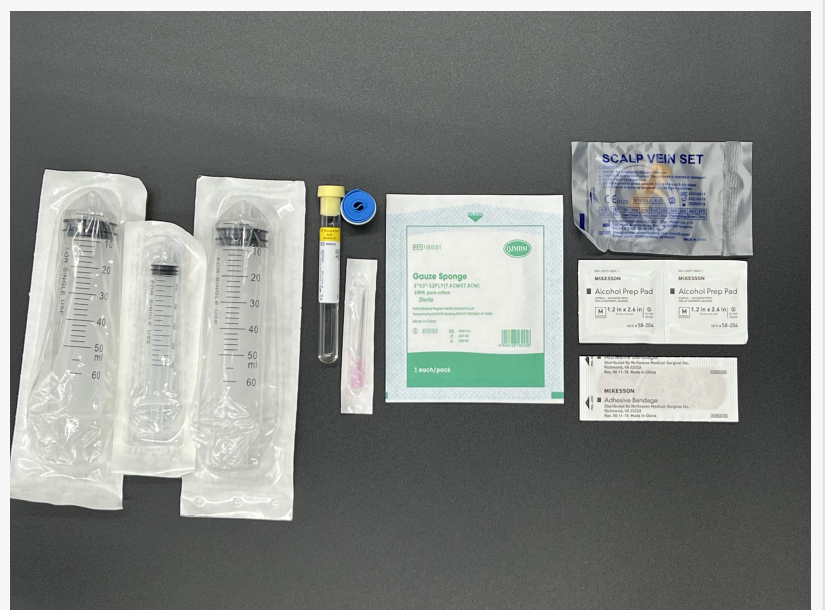
ReBella Blood Draw Kit Components