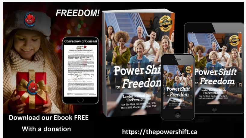
2022 Revolution Resolution