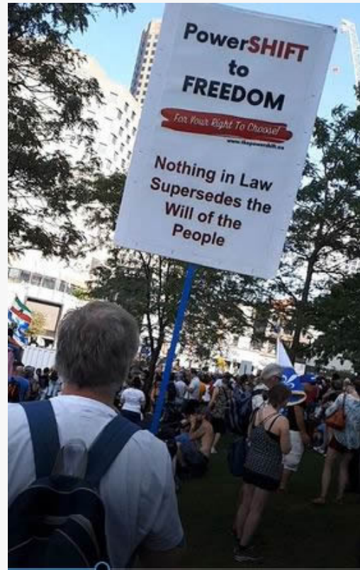
Powershift to Freedom sign