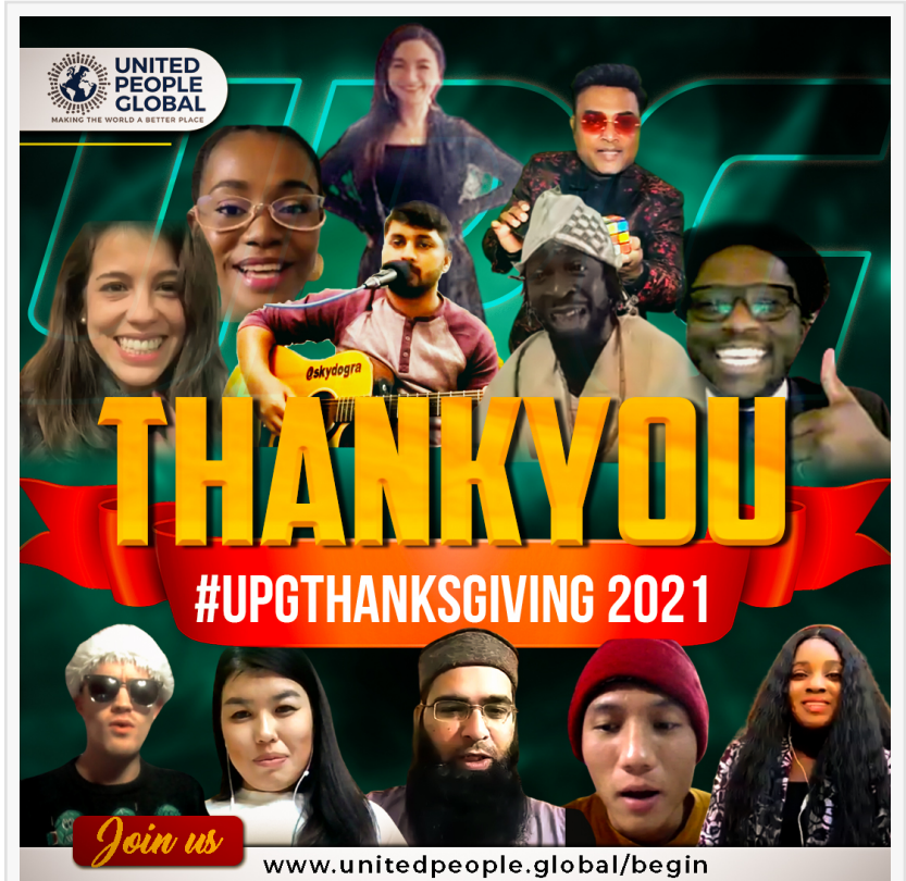
UPG-Thanksgiving - Special Thanks

About United People Global: UPG is a community that encourages and enables people to make the world a better place. UPG believes that all people have the power and the responsibility to participate in making the world a better place. The work of this global community is facilitated by