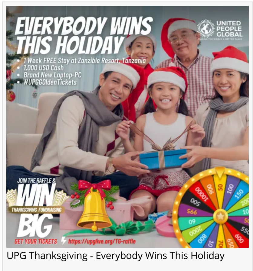
UPG Thanksgiving - Everybody Wins This Holiday