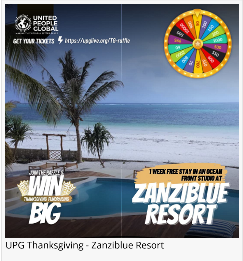
UPG Thanksgiving - Zanzibblue Resort