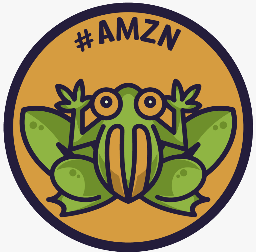
Spectruth's #AMZN token badge