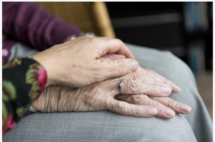
There were 15,457 involuntary psychiatric examinations initiated on senior citizens during 2018/2019 according to the Baker Act Reporting Center.