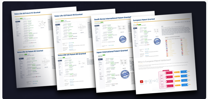
Voice Life Granted Patents