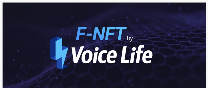
Voice Life F-NFT

Voice Life has now found a new way to share with everyone a revolutionary energy asset in the form of a Fractional Non-Fungible Token, also known as a F-NFT. The technology behind these F-NFTs has allowed us to store Voice Life's Intellectual Property on the blockchain and share the ownership of it with the F-NFT owners, all within the Binance's BNB Chain Ecosystem.