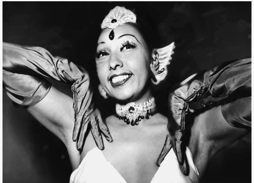
Screens at ADIFF DC on Friday, August 17, 2018 @ 6:30pm