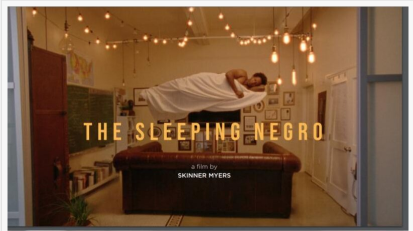
The Sleeping Negro